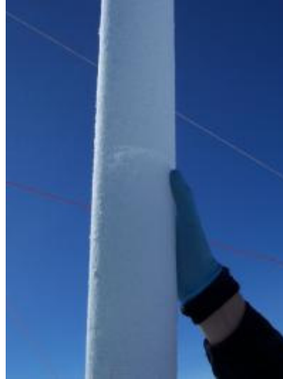
A record of fossil-fuel use A section of the 100-meter ice core in Greenland.

The research was funded by the National Science Foundation's Office of Polar Programs and the Joint Institute for the Study of the Atmosphere and the Ocean (JISAO).